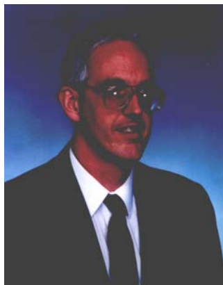
Who's That? (See Inside)