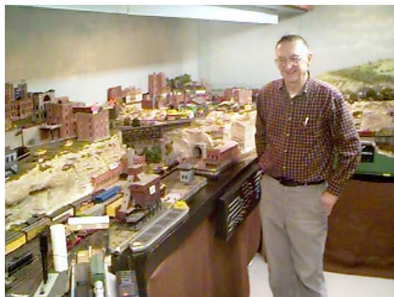
MM What? (See Inside)